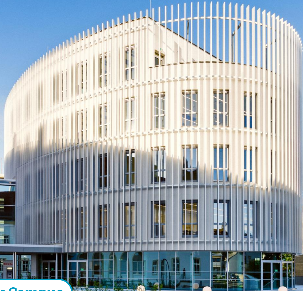
Wiener Neustadt – City Campus