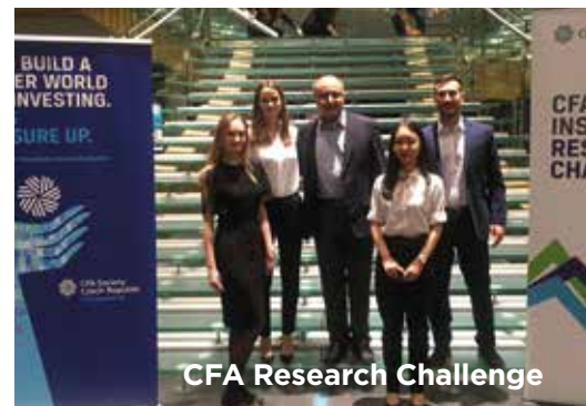
CFA Research Challenge